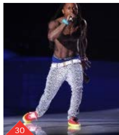
FASHION Lil Wayne's Jeggings and The Policing of Black Male Style