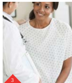
BEAUTY You're Too Old To Get A Boob Job