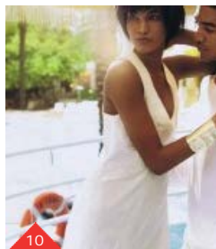
FASHION Does Dating Require A Dress Code?