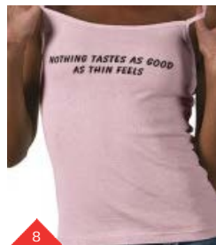
BEAUTY "Nothing Tastes As Good As Skinny Feels" T-Shirts Sold To Children?