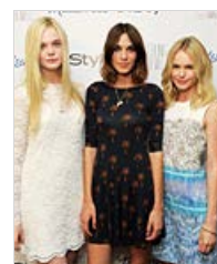
InStyle Fêtes Alexa Chung's New Madewell Collection