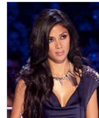
X Factor Judge Nicole Scherzinger's Outfits