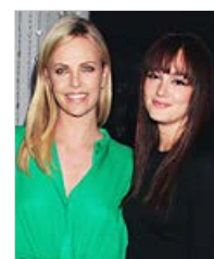
Charlize and Leighton Make a Connection and More!